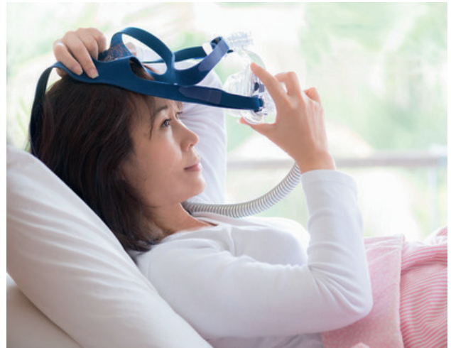
Fig. 4: If the fan is installed in a suitable noise-dampening housing, any sleep disturbance will be minimal.

pering conversation. Built into a suitable sound-absorbing housing, any sleep disturbance will be minimal (Fig. 4).