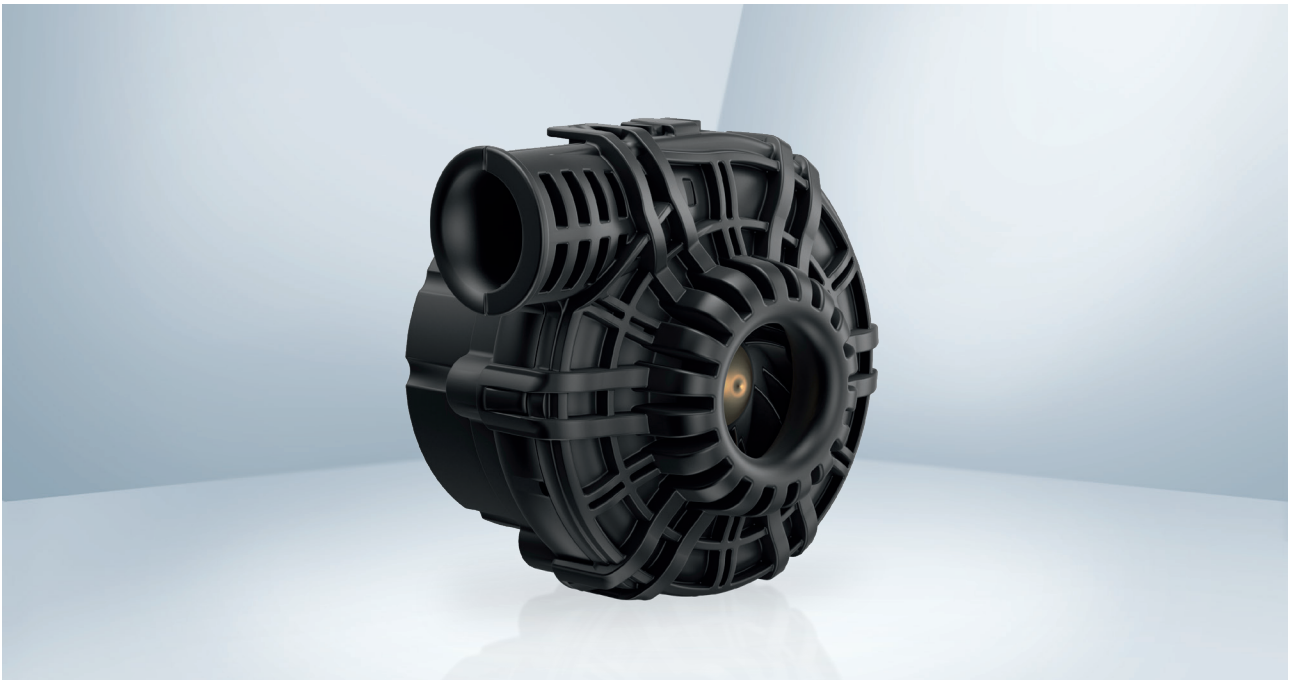
Fig. 1: The RV45 offers dynamic, efficient and quiet air delivery.

The reliability of medical devices and their components is particularly important. When using apnea machines at home or as a ventilator in the intensive care unit, simple operation and low noise level are also important. If, for example, a ventilator is used during sleep, such a device must be located close to the user and must not interfere with healthy sleep due to operating noises. In order to meet these requirements, the fan and drive specialist ebm-papst developed the RV45 radial fan for ventilators and similar dynamic applications that meets these requirements - safe, reliable, efficient and quiet (Fig. 1).