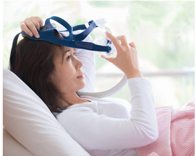
Fig. 4: If the fan is installed in a suitable, noise-damping device housing, no disturbance is to be expected even at night.

The RV45 is very compact with only 64 x 69.5 x 54.5 mm and is available for operation on two voltages 12 and 24 VDC. The power consumption is around 43 W in free blowing operation, but running in typical applications with speed control can often average 20 W lower, which also ensures long running times in battery operation. The possible high power consumption is indispensable for the short-term "sprint" in order to fulfill the requirements on high dynamic operation. The maximum free blowing air flow is up to 410 l/min and the maximum pressure increase is over 5,000 Pa (Fig. 3). This is sufficient for large lung volumes, heavy soft palate cases or for use in secretion mobilization. All wetted air-contacting parts of the 135g light-weight fan are constructed from FDA compliant OK materials which are harmless to human respiratory physiology. Thanks to the selected vibration damping materials and the optimized aerodynamic design, the operating noise is minimized and is at a level similar to a whispering conversation. Built into a suitable, sound-absorbing housing, any sleep disturbance will be minimal (Fig. 4).