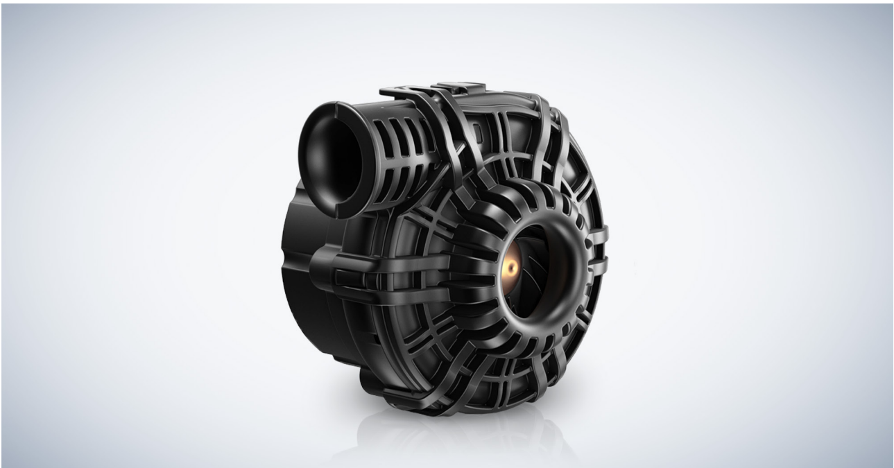
Fig. 1: The RV45 offers highly available, efficient and quiet air delivery (actual size).

The reliability of medical devices and their components is particularly important. Particularly when using apnea machines at home or as a ventilator in the intensive care unit, simple operation is also important. If, for example, a ventilator is used during sleep, such a device must be located close to the user and must not interfere with healthy sleep due to operating noises. In order to meet these requirements, the fan and drive specialist ebm-papst from St. Georgen in the Black Forest developed the RV45 radial fan for ventilators and similar dynamic applications that meets these requirements - safe, reliable, efficient and quiet (Fig. 1).