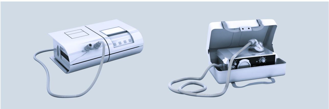
Fig. 3: CPAP breathing device and a mobile breathing device

Because the delivery rate (linear) and the delivery pressure (square) of a radial fan impeller increase with the speed, the high rated speed of up to 50,000 rpm allows the fan to be very compact. The motor drive and control electronics are not included inside the RV45 blower and must be provided externally, which offers advantages in matching the fan to the respective task. Depending on the medical device, the user can provide their own specifically optimized control system. However, for a wide range of standard tasks or fast test operation, a control module from the manufacturer is available which is specially adapted to the motor. This "Power Module RV45" is suitable for simple speed control and includes a tachometer output, thus offering a plug-and-play solution for the customer. This can be useful in both medical and industrial applications, e.g. for the dynamic ventilation of fuel cells, air filter technology, packaging machines, smoke detection systems, printed circuit board production or exhaust air systems for soldering and welding gases as well as breathing apparatus and similar devices. A version of the RV45 fan with Hall IC sensors in the motor, for a simpler in-house development of the control electronics including an NTC temperature sensor option, is available as a customer option.