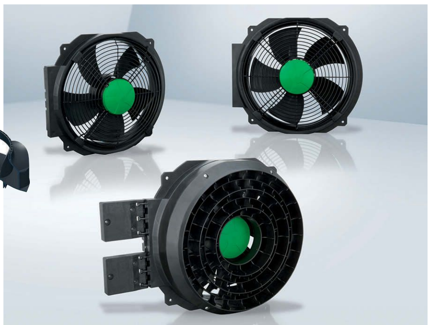
EC fans, optimized for use with evaporators in cold storage areas.