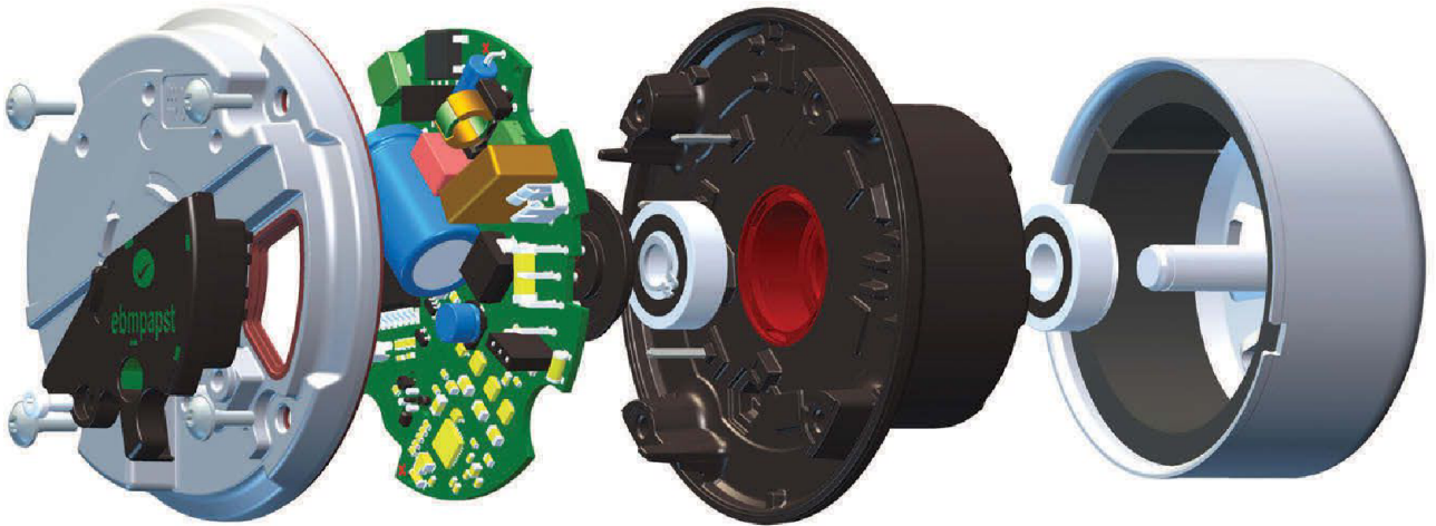
Compact electronics, encapsulated stator and rotor.

150 W and a duty cycle of 75%, the annual energy consumption of the approximately 25 million motors of this type employed as fan drive units in various applications was close to 25 billion kWh. For reference, the 99 nuclear reactors in the USA produced a total