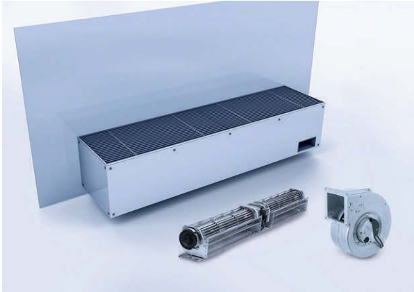
Ventilated facade systems with EC centrifugal or tangential blowers.