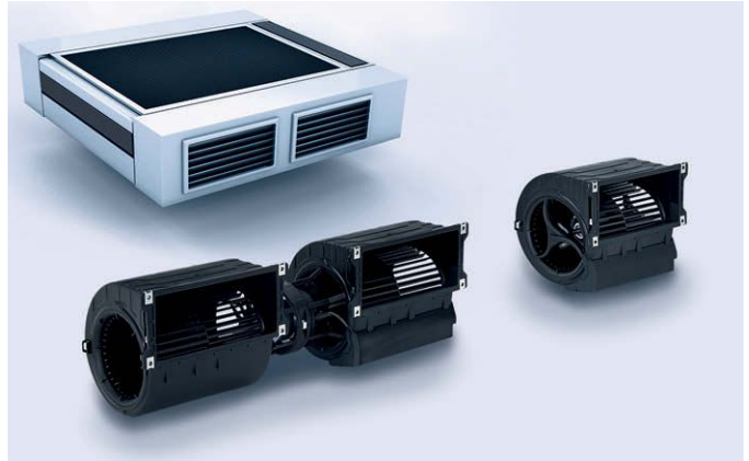
Air curtain: The blowers are constantly in operation; a considerable amount of energy can therefore be saved by switching to EC motors.

to the development of a new series of EC motors, conventional AC motors can be replaced with highly efficient EC versions with the same mechanical design. It is basically the same process as for old 100 W bulbs. These can be replaced by energy-saving bulbs which fit in the same socket. The development of EC motors that are mechanically compatible with AC motors and their extremely compact design did however represent something of a technical challenge.