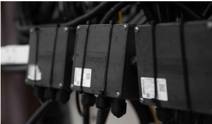
Picture 2: All the data from the new sensors converges at the gateways and is uploaded to the epCloud.

Picture 1 Lukas Zwiessele for ebm-papst Picture 2 Lukas Zwiessele for ebm-papst