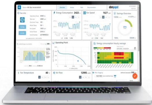
Image 1: The epCloud is the center where the system data converges and can be monitored. The basic functions and digital services are also mapped here.