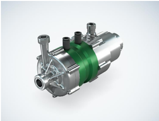
Fig. 1: ebm-papst develops turbo compressors in the 1 kWe to approx. 55 kWe electrical power range that allow variable flow quantities of various refrigerants and use significantly less refrigerant by reducing the internal volume by 90% (example: P2 compressor).